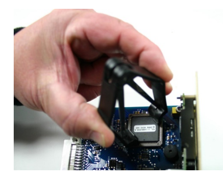
OK Industries Model EX-5 PLCC Extraction Tool

Step 6: Insert the new microcontroller into the microcontroller socket. Note the location of Pin 1 and the beveled corner of the microcontroller and microcontroller socket. Make certain that all pins are fully engaged and that the microcontroller is firmly seated in the microcontroller socket.