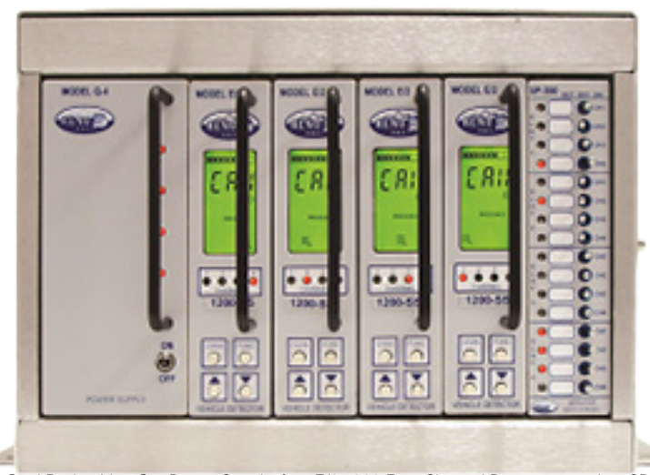
Reno A & E M-6D Detector Card Rack with a Q-4 Power Supply, four E/2-1200 Four Channel Detectors, and an SP-300 Detector Switch Panel

The M-6D detector card rack has been specially designed for NEMATS 1 /TS 2 applications where shelf space is at a premium. This high-density rack is capable of housing a power supply; four, single width (1.12 inch), four channel detectors; and a half width BIU/2 bus interface unit or a Reno A&E Model SP-300 detector switch panel. The Model SP-300 detector switch panel allows the user to disconnect or simulate detector call outputs.