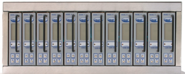
Reno A&E M-12C Detector Card Rack with Twelve C-1200 Two Channel Detectors

The M-12C detector card rack has been designed for NEMA TS 1 applications where a shelf mounted detector rack is needed. This rack is capable of housing a power supply and ten single width (1.12 inch), two or four channel detectors. The M-12C may be configured to accept, in place of the power supply, two additional single width detectors.