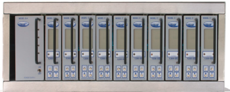
Reno A&E M-12C Detector Card Rack with a Q-4 Power Supply and Ten C-1200 Two Channel Detectors

Reno A&E Model MH wiring harnesses simplify installation